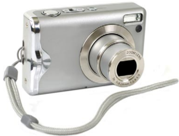
This is a new camera.