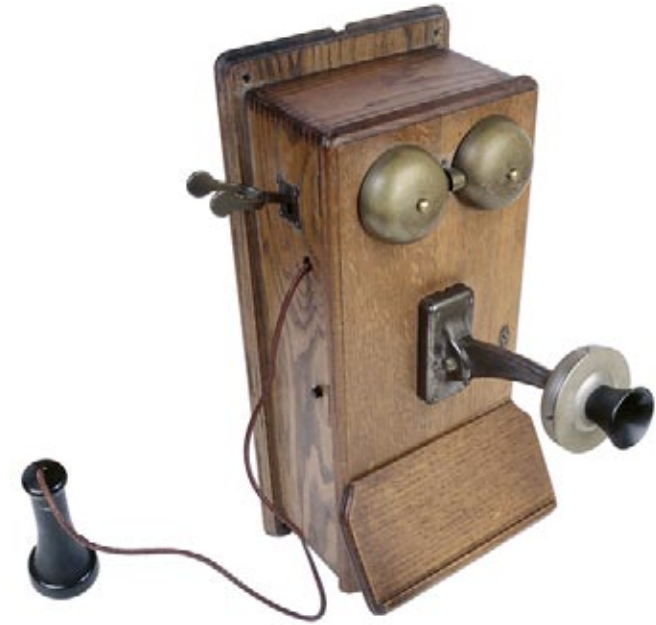
This is an old telephone