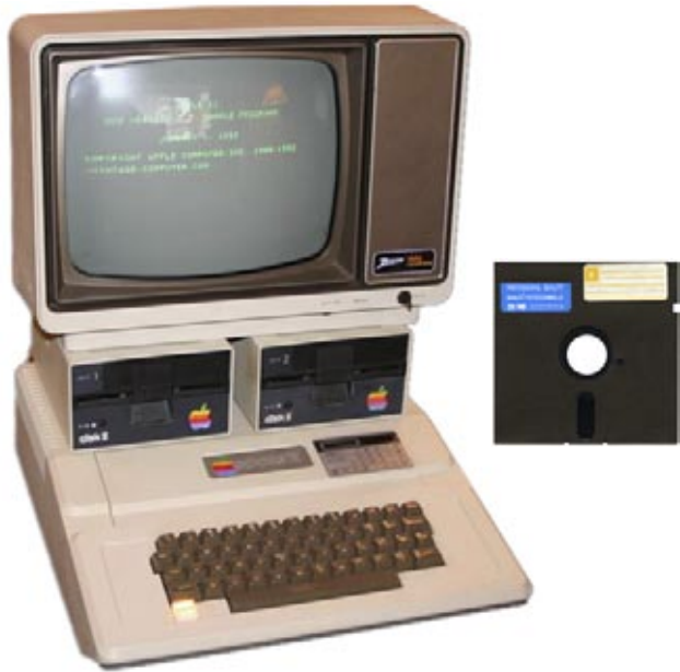
This is an old computer.