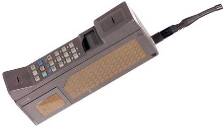
This is an old cell phone.