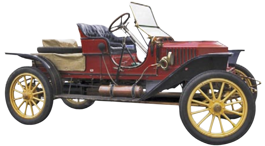
This is an old car.