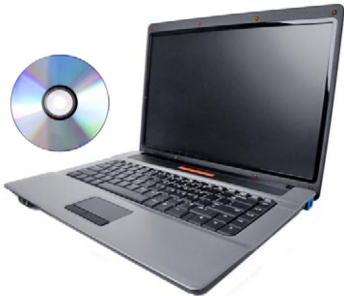
This is a new computer.