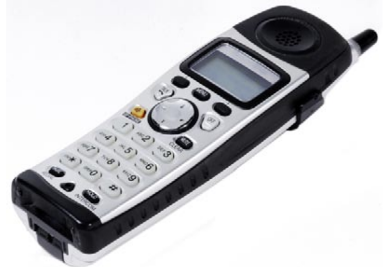
This is a new telephone