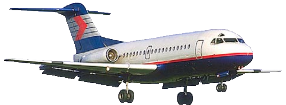
This is a new plane.