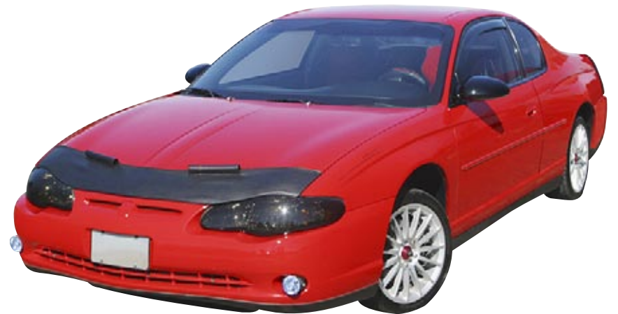
This is a new car.