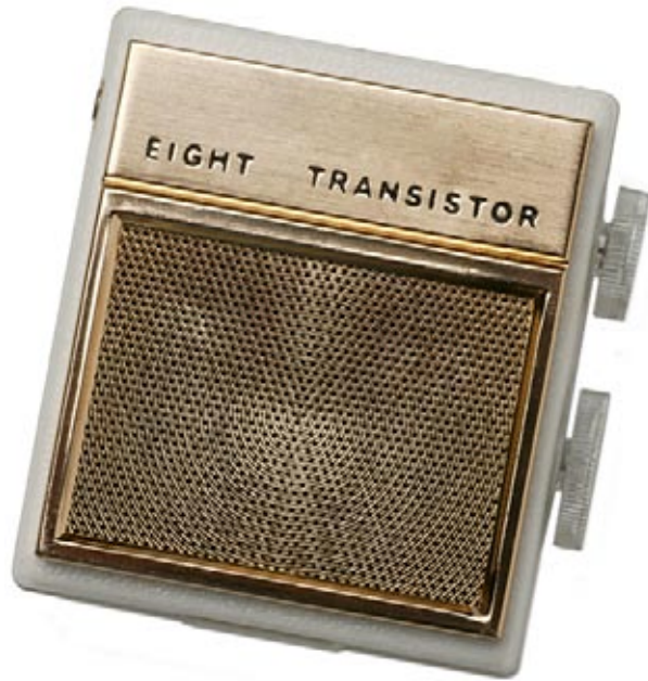
This is an old music player.