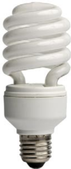
This is a new light bulb.