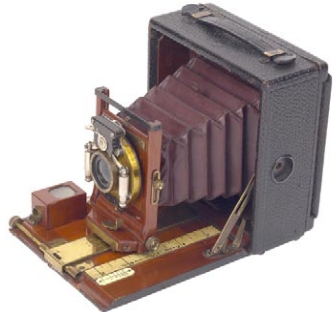
This is an old camera.