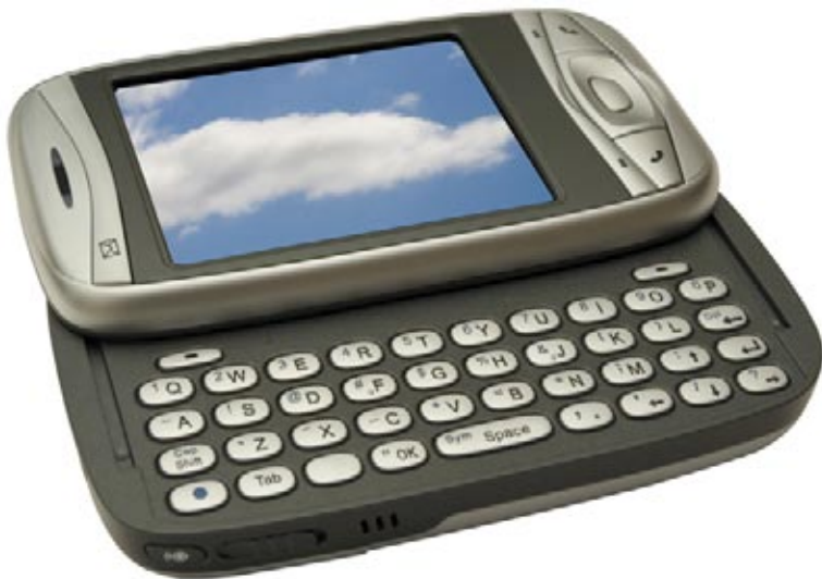
This is a new cell phone.