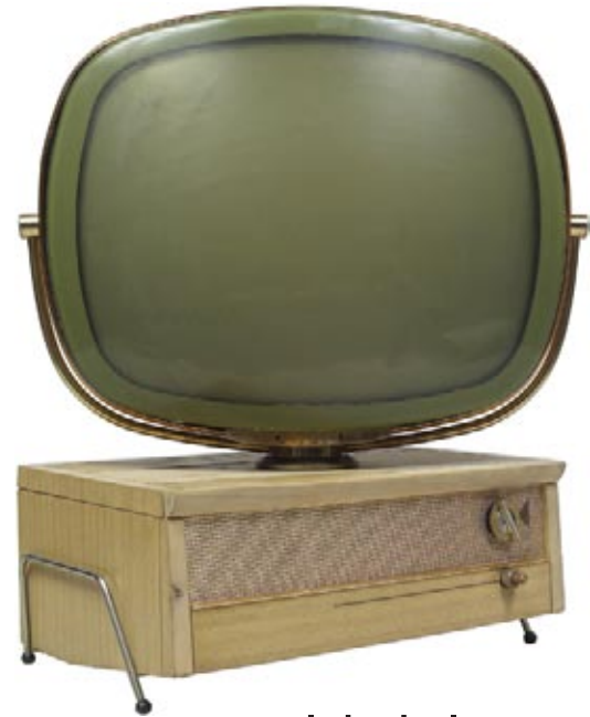
This is an old television.