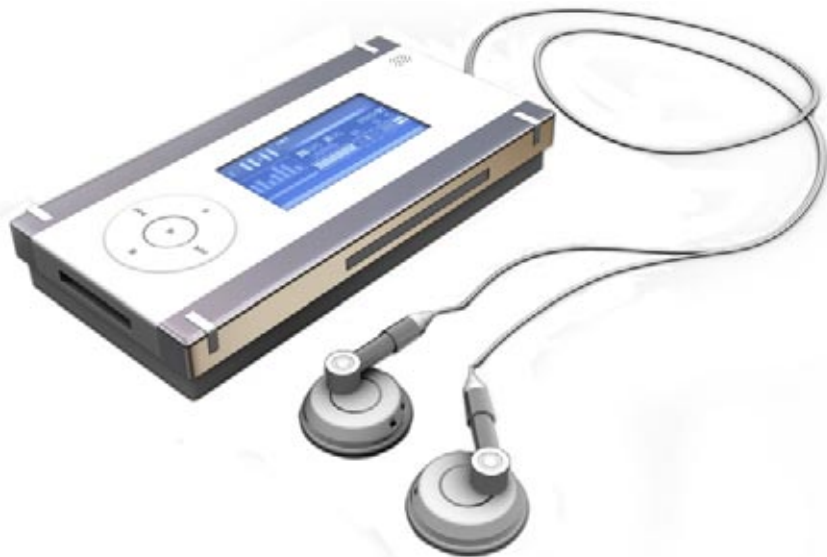
This is a new music player.