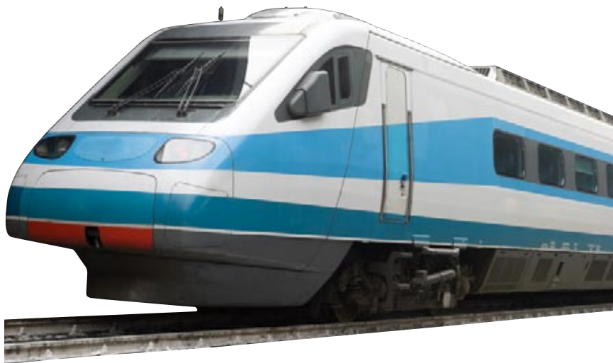
This is a new train.