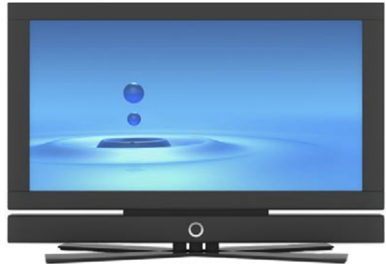
This is a new television.