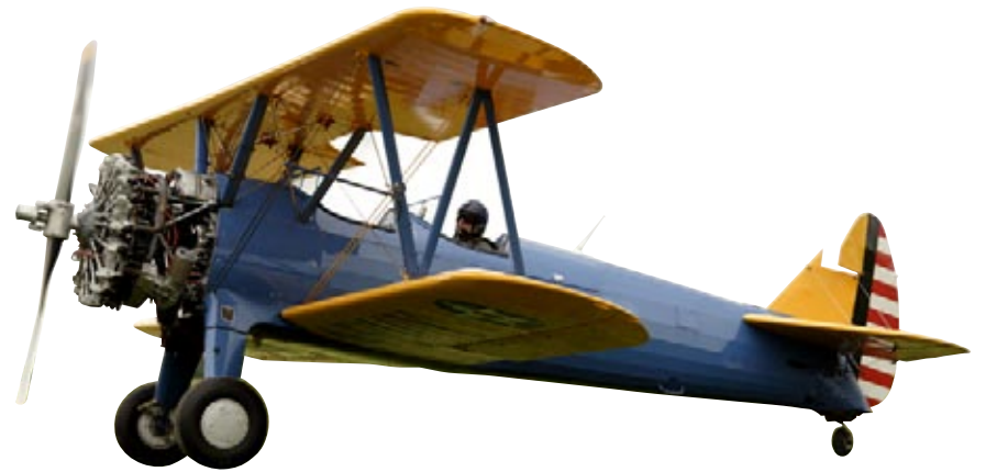
This is an old plane.